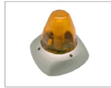
AC Flashing Light