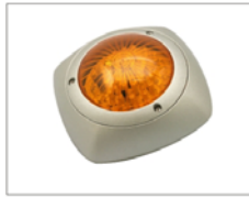
DC Flashing Light